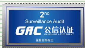
2 nd Surveillance audit