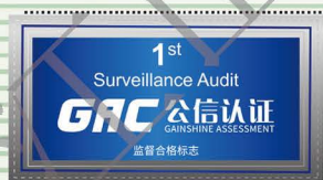
1 st Surveillance audit

This certificate will not be in force unless the annual label for surveillance qualified is stuck thereunder.