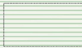
3 rd Surveillance audit