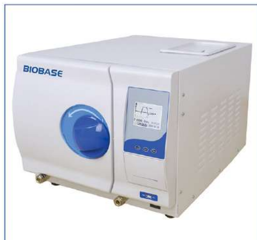
Table Top Autoclave Class B Series