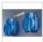
Waterproof Socket 2 waterproof sockets are located in the side wall, for optimum convenience of using small devices inside the cabinet.