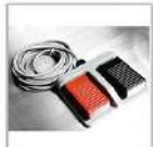
Foot Switch Adjust front window height by foot during experiment, to avoid airflow turbulence caused by arm movement.