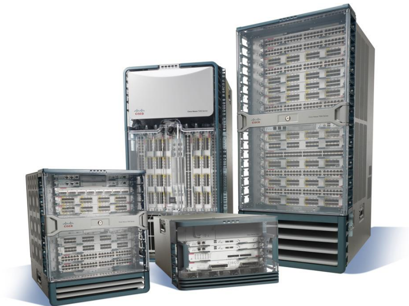
Figure 1. Cisco Nexus 7000 Series

The first in the next generation of switch platforms, the Cisco Nexus 7000 Series (Figure 1) provides integrated resilience combined with features optimized specifically for the data center for availability, reliability, scalability, and ease of management.