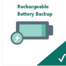
Rechargeable Battery Backup