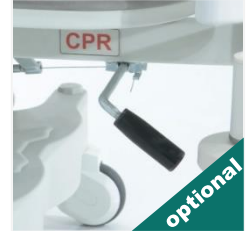
Dual Sided Manual CPR at Backrest