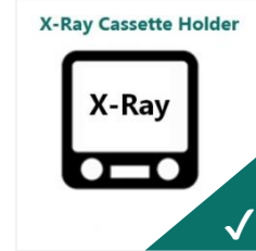
X-Ray Cassette Holder at Backrest