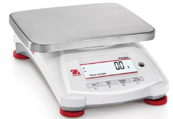
PX12001 and PX12001/E model

Four quick keys enable easy operation of multiple weighing modes.