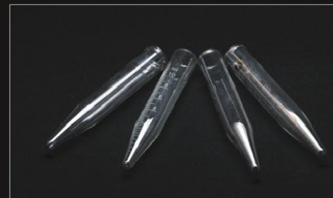
1241 Glass Centrifuge Tube Without Graduation 10ml 15ml 1242 Glass Centrifuge Tube With Graduation 10ml 15ml