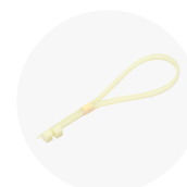
2x plastic straps