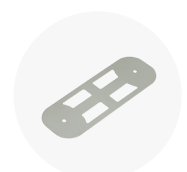
Ceiling mount base