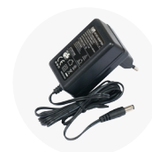
24V 0.8A Power adapter