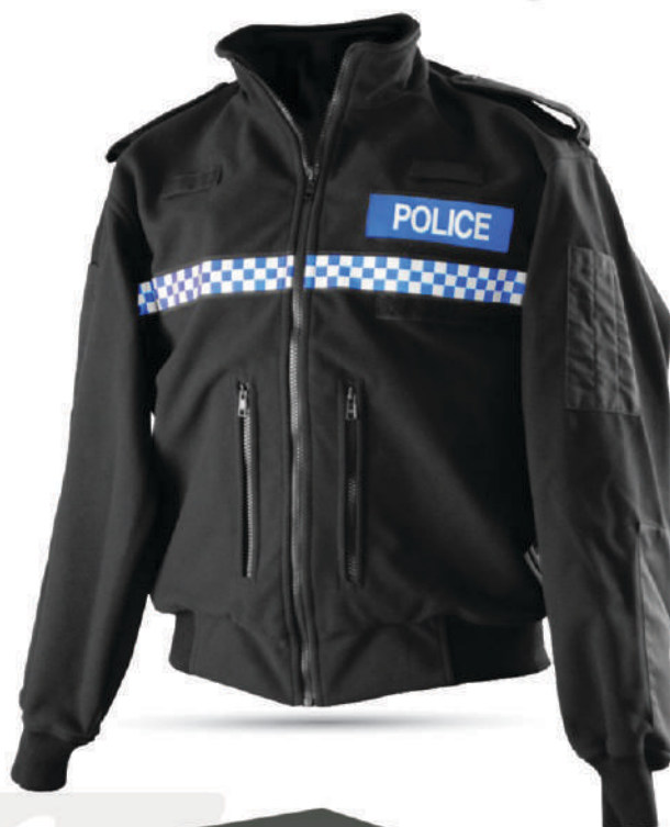
DS-1152 Police Jacket