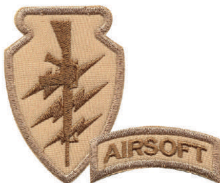
DS-159 Embroidered Patch