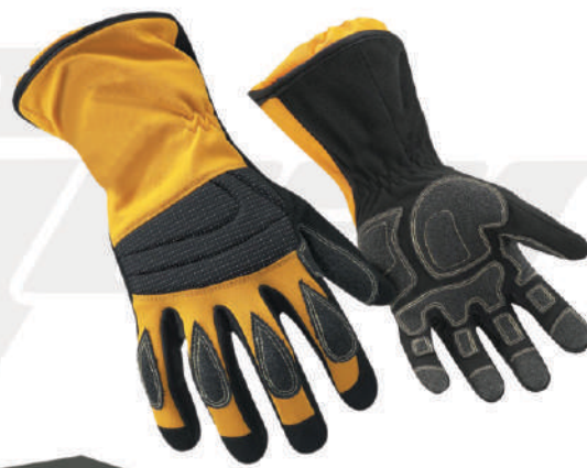
DS-1752 Leather Work Glove