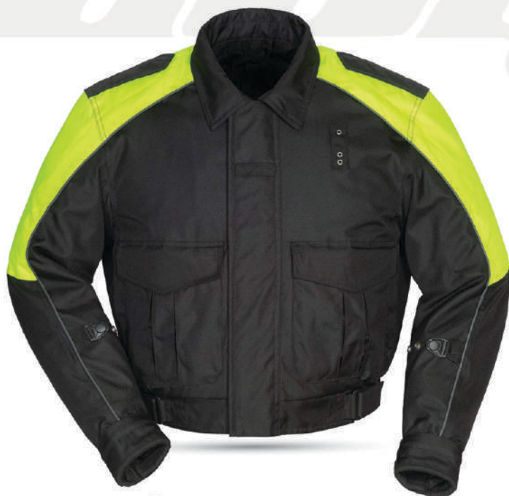
DS-1153 Police Jacket