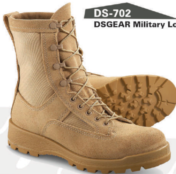
DS-702 DSGEAR Military Long Boots