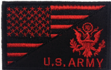
DS-150 Embroidered Patch