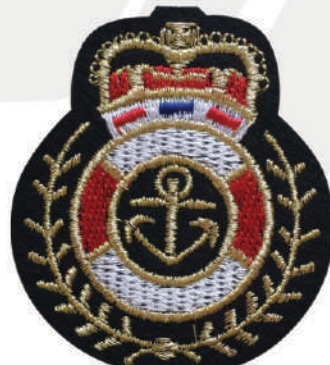
DS-157 Embroidered Patch