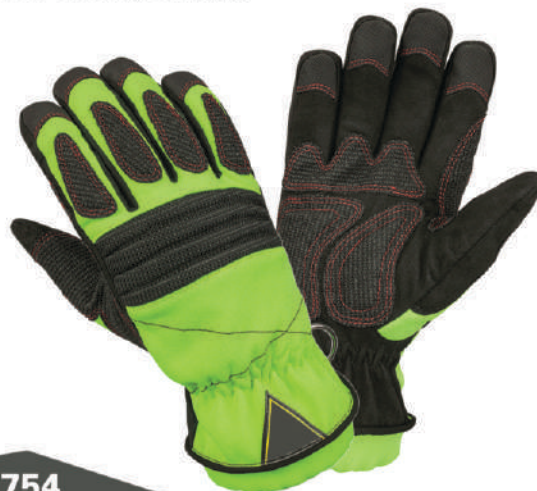
DS-1754 Leather Work Glove