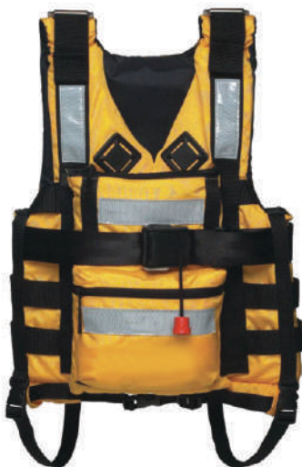
DS-1702 Leather Work Glove