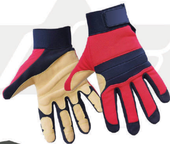
DS-1751 Leather Work Glove