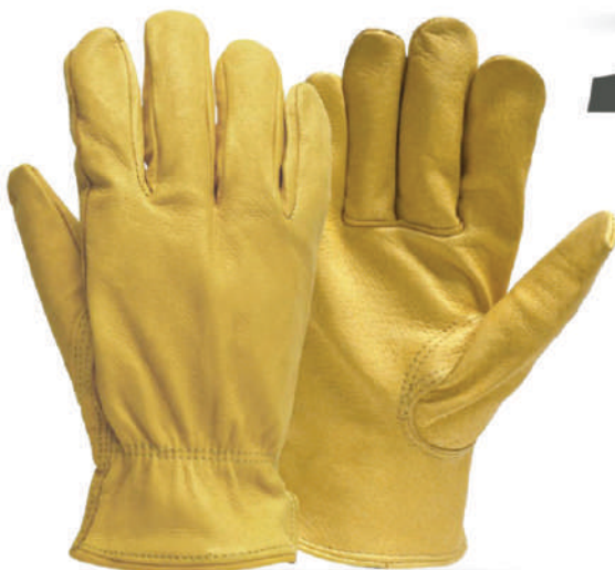
DS-1604 Leather Work Glove