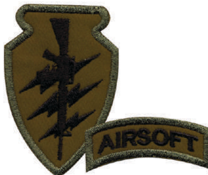
DS-160 Embroidered Patch