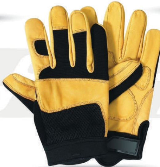
DS-1603 Leather Work Glove