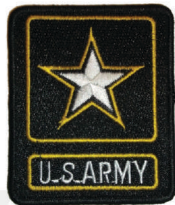
DS-155 Embroidered Patch