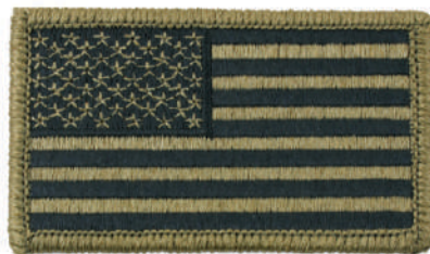
DS-151 Embroidered Patch