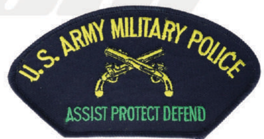
DS-158 Embroidered Patch