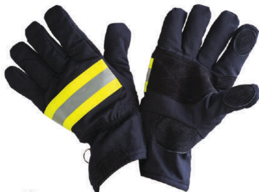
DS-1753 Leather Work Glove