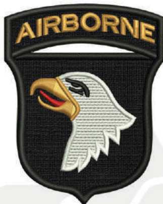
DS-153 Embroidered Patch