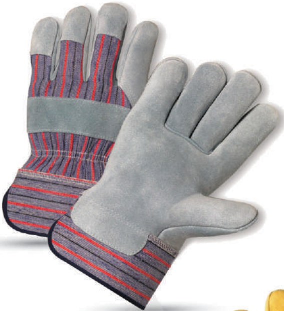
DS-1601 Leather Work Glove