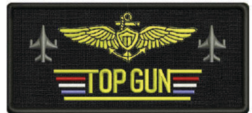
DS-152 Embroidered Patch