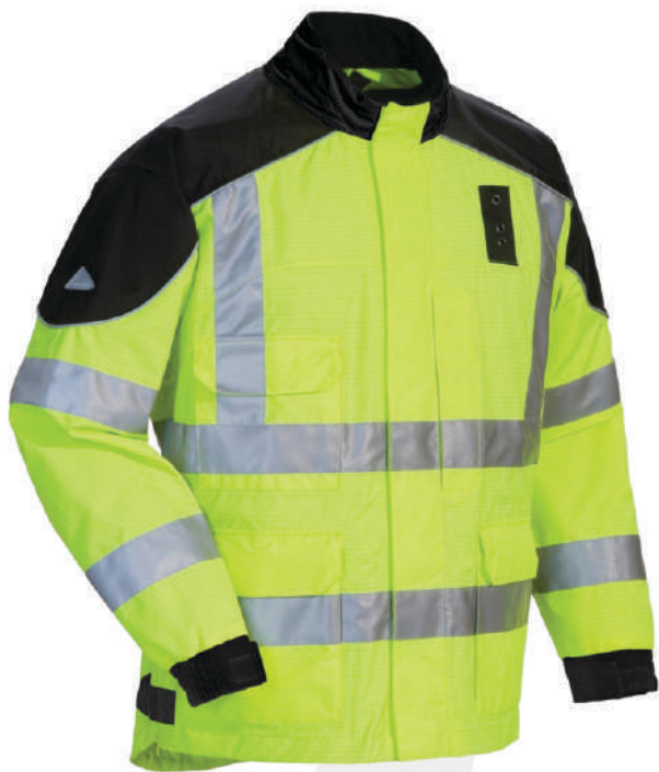
DS-1151 Police Jacket