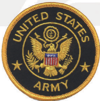
DS-156 Embroidered Patch