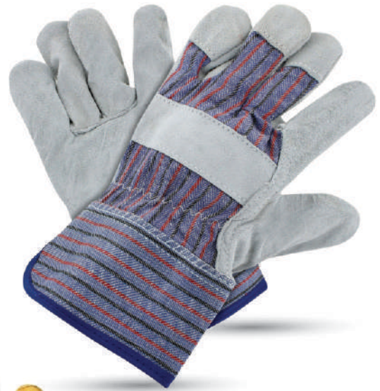
DS-1602 Leather Work Glove