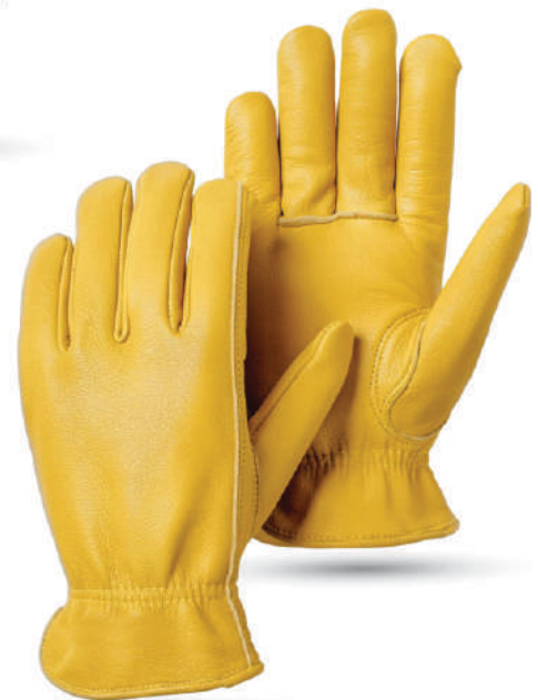
DS-1605 Leather Work Glove