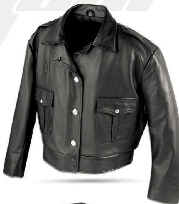
DS-1154 Police Jacket