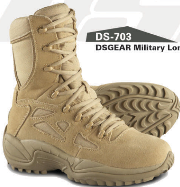
DS-703 DSGEAR Military Long Boots