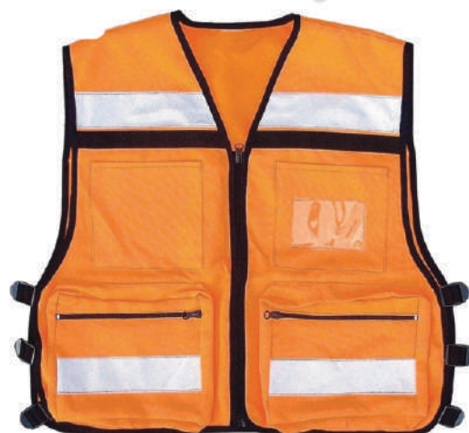
DS-1703 Leather Work Glove