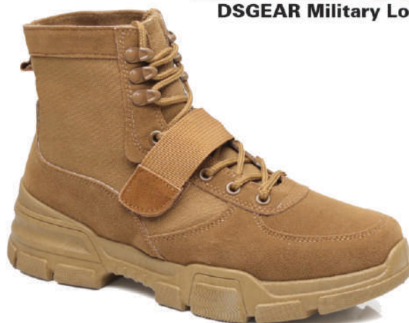
DS-704 DSGEAR Military Long Boots