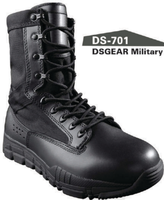
DS-701 DSGEAR Military Long Boots