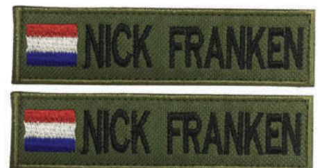
DS-161 Embroidered Patch