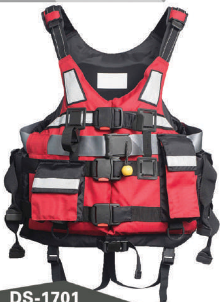
DS-1701 Leather Work Glove