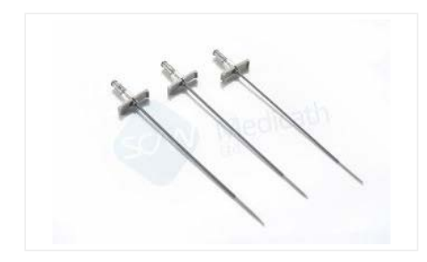
Peelable Introducer Sets