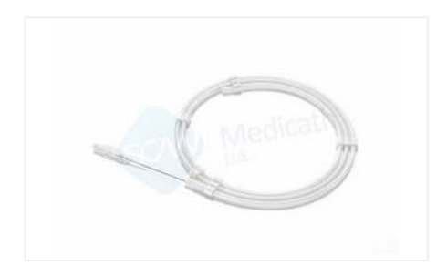
PTCA Balloon Catheter