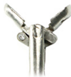
Scissors joint (Fig. TruBite)