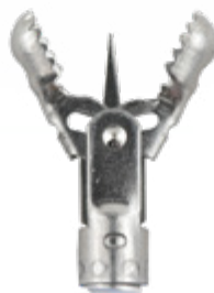
Cam-Design (Fig. TechBite™)