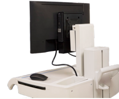
OPTIPLEX MICRO DUAL VESA MOUNT WITH ADAPTER BRACKET

This mount allows the Micro to be VESA mounted to select Dell E Series displays.