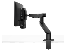
DELL SINGLE MONITOR ARM - MSA20

Mount your system on a wall or under a desk. Includes an adapter box to securely house the system's power adapter.