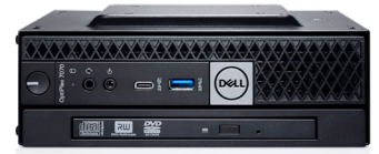
OPTIPLEX MICRO DVD+/-RW ENCLOSURE

Mount your system between two VESA compatible devices. Includes an adapter box to securely house the system's power adapter.