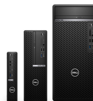
OPTIPLEX DUST FILTERS

Thermally tested custom cable covers offer an easy to install and attractive way to manage cables and secure ports.