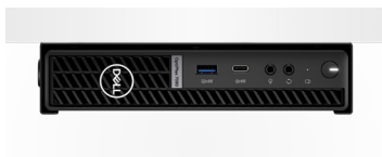
OPTIPLEX MICRO VESA MOUNT WITH ADAPTER BRACKET

Mount your system on a wall or under a surface with a VESA-compatible DVD+/-RW enclosure with full optical drive access. Includes an adapter box to securely house the system's power adapter.