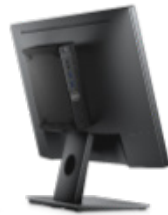
OPTIPLEX MICRO ALL-IN-ONE MOUNT FOR DELL E SERIES MONITORS

Small footprint mounting solution adapts to your environment, with cable management and monitor height adjustability, tilt, swivel and pivot functions.