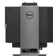
OPTIPLEX SMALL FORM FACTOR ALL-IN-ONE STAND (COMING SOON)

Minimize your footprint with this arm that offers easy installation and enhanced adjustability while keeping cables neatly hidden from view.