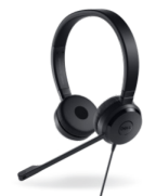
DELL PRO STEREO HEADSET - UC350

Custom dust filters safeguard internal components in factory, warehouse, or retail environments.