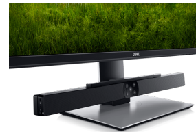
DELL PROFESSIONAL SOUND BAR - AE515M

Optimize your workspace with this efficient 21.5" monitor built with an ultrathin bezel, a small footprint and comfort-enhancing features.