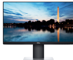
DELL 22 MONITOR - P2219H

23.8" ultrathin bezel optimized for dual display productivity. Easy Arrange feature enables multitasking efficiency and its small base frees valuable workspace.