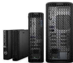
OPTIPLEX CABLE COVERS

Wired mouse with fingerprint reader offers convenient and secure login and online access without passwords.