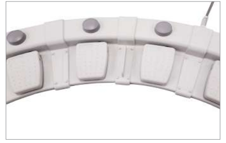
Wired foot controller type WS-36.6 (option)