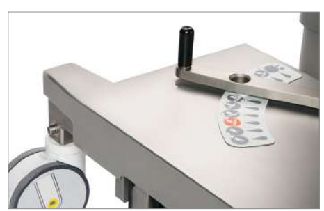
SU-03 AlterSafe™ alternative drive (H-base)