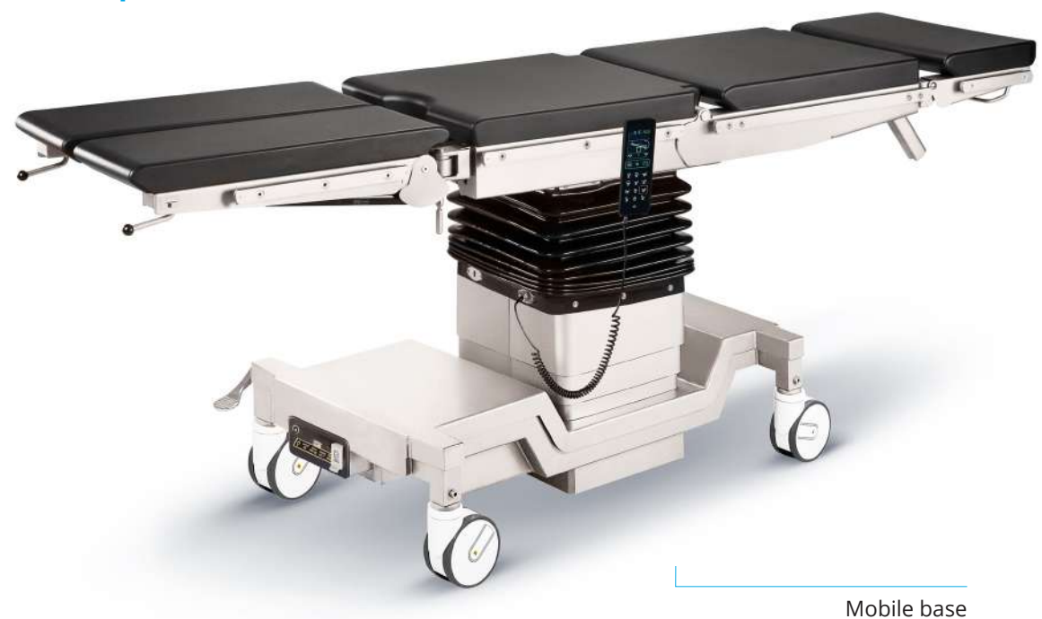
H-shaped base equipped with large 125 mm wheels