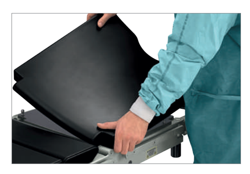
Quick and easy way to remove the mattresses

Table is equipped with removable, seamless, molded polyurethane pads 50 mm thick. All mattresses are antistatic, waterproof and X-ray translucent. They can be easy detached from the table top (they are mounted on with the use of special pegs, which secures them in place and prevents from moving during the table adjustments). The homogenous surface of the mattress is easy to clean and resistant to disinfecting agents.