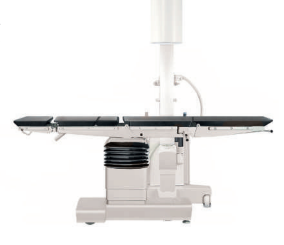
Range of X-ray permeability (remember, you can always switch the leg and head segments).