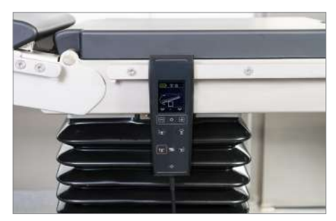
Wired bbSafe™ hand controller

The alternative drive ensures operation of all electric table adjustment options in the event of control circuit failure or essential power supply failure. Tables with the alternative AlterSafe™ technology drive have two independently operating drive systems: electro-hydraulic and mechanical-hydraulic. The alternative mechanical-hydraulic AlterSafe™ system allows for the operation of all functions available through the electrical system. Individual table functions are selected using a lever placed in the table base and are carried out using a foot pump.