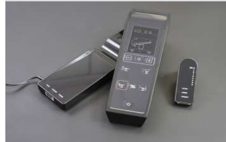
Wireless rCover™ controller with wireless charger (option)