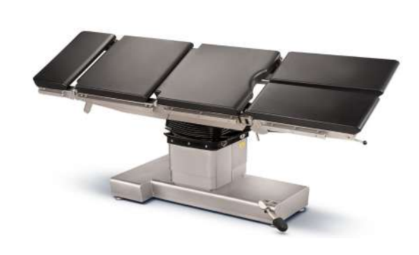
Proctologic position Proctology attachment WS-30.5