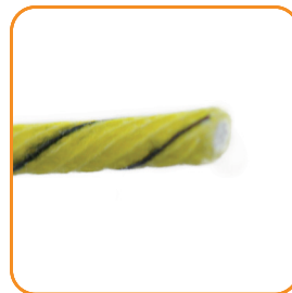
1. Reinforced cords with higher tensile strength and abrasion resistance.