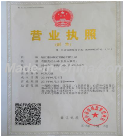
Description: Business License