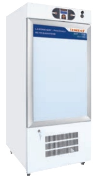
OPTIONAL BLOCK DOOR