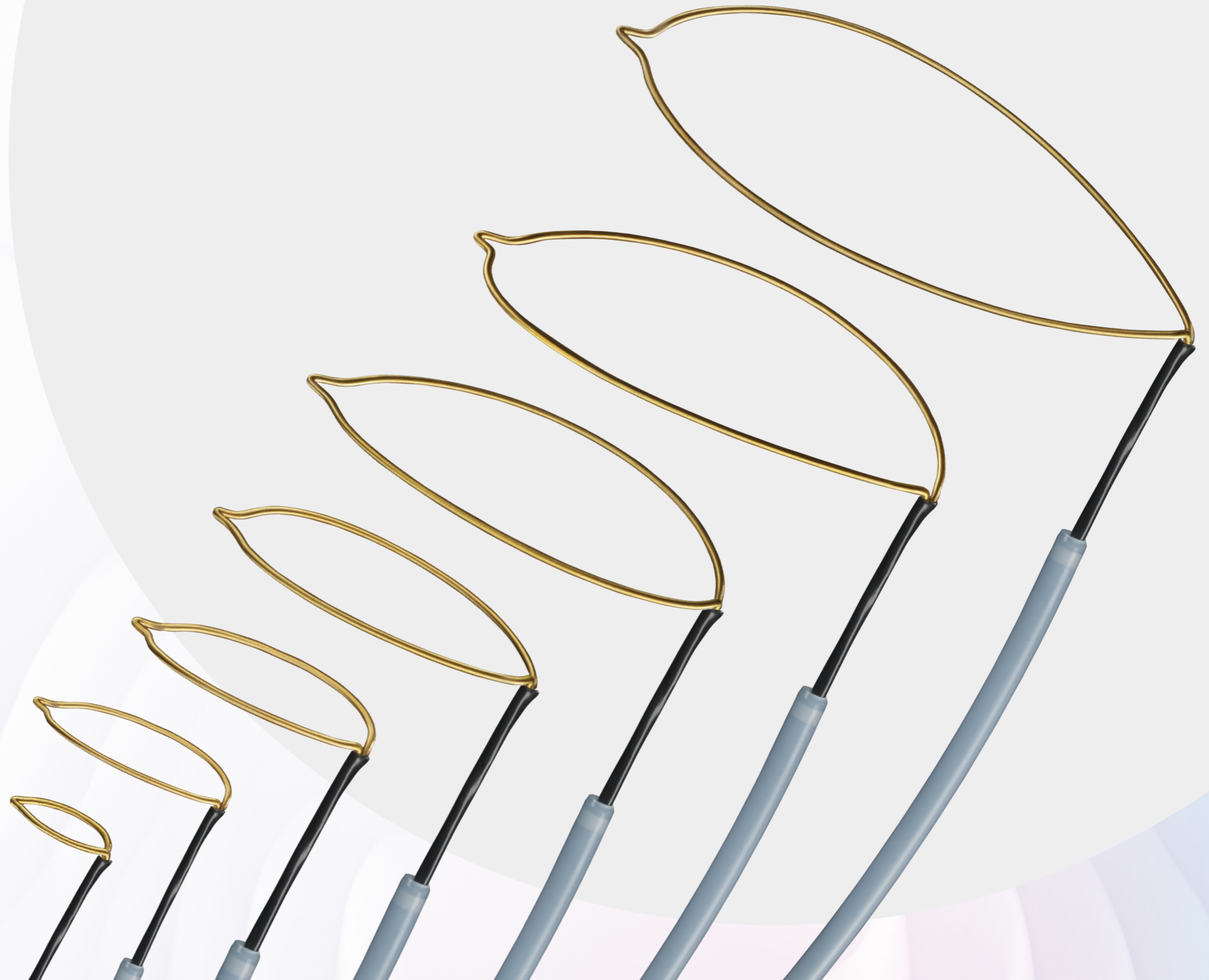
Amplatz GooseNeck™ Snare