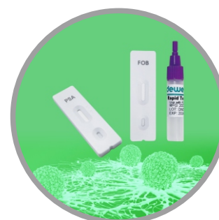
Tumor Markers or Inflammation P15