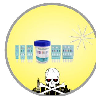
Drug of Abuse P1