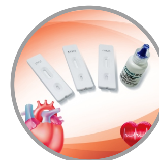
Cardiac Markers P13