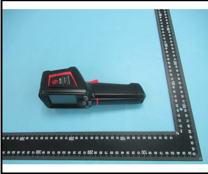
Photograph of Sample