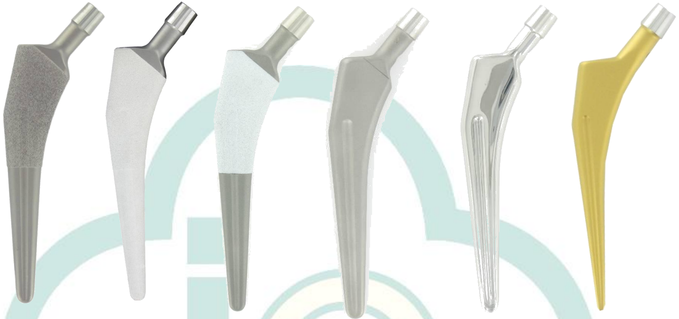
FIG.1: ECOFIT® CEMENTLESS CPTI FIG.2: ECOFIT® CEMENTLESS T-HA FIG.3: ECOFIT® CEMENTLESS HA FIG.4: ECOFIT® CEMENTED FIG.5: ECOFIT® CEMENTED HIGH FIG.6: ECOFIT® CEMENTED TIN

The EcoFit® hip stems are femoral hip stem components for total hip or hemi-hip arthroplasty. The EcoFit® hip stem are intended either for uncemented, press fit or cemented fixation. It is indicated in cases of: