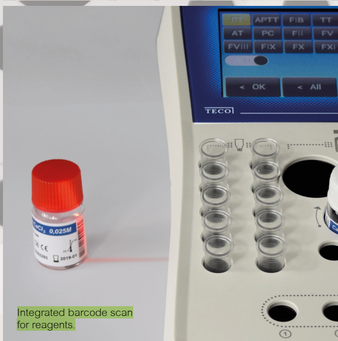
Integrated barcode scan for reagents.