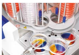
Systec Mediafill with Tri-Plates