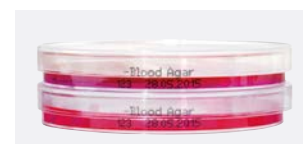
labelling on the sides of Petri dishes