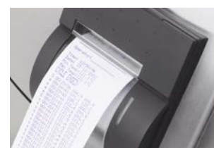
Systec Mediaprep printer for documentation