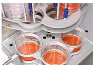
Systec Mediafill with Petri dishes