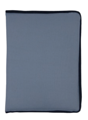
Flat applicator AP-1