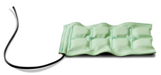
Flexible applicator APE-1