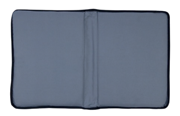
Flat applicator AP-2

Accessories for Magnetronic MF-2, Multitronic MT-8