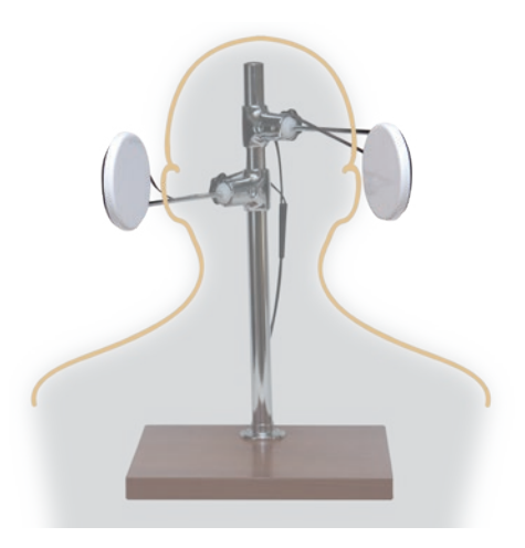
Stand applicator AST-2