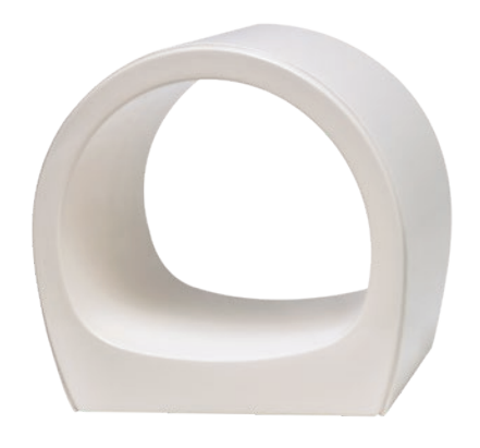
Reel applicator AS-204