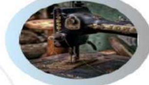
Years of Experience