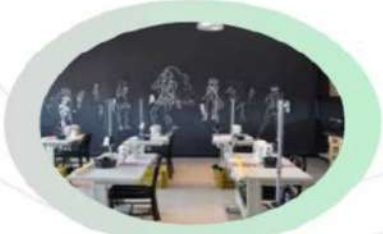
Well Trained Team