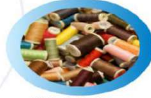
Wide Color Range