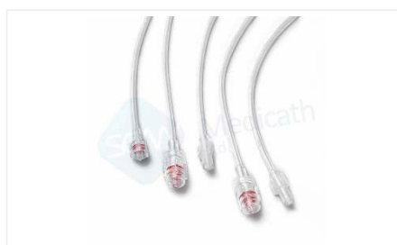
High Pressure Tubing