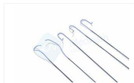
Radiology Angiographic Catheter