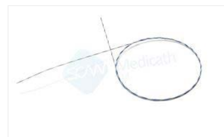
Zebra Guide Wires