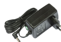
24 V 1.2 A power adapter included

IPsec hardware encryption (~470 Mbps) and The Dude server package are both supported, and the microSD slot provides improved read/write speed for file storage.