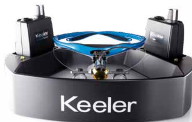
Loupes with New Keeler Loupe Light in twin charger tray with optional yellow filter