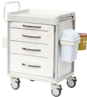
MYS-728P METAL PANSUMAN ARABASI METAL DRESSING TROLLEY