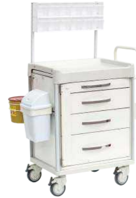
MYS-728A METAL ANESTEZİ ARABASI METAL ANESTHESIA CART