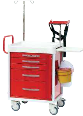
MYS-728N METAL ACİL ARABASI METAL CRASH CART