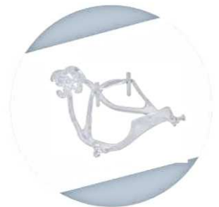
Reinforced Polycarbonate Frame