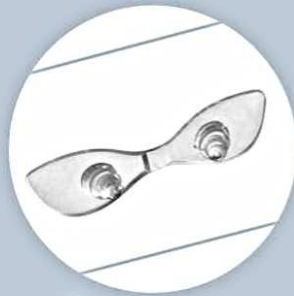
Silicone Head Support