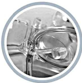
Oxygen and Pressure Port