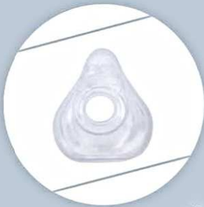
Double Frame Silicone Body