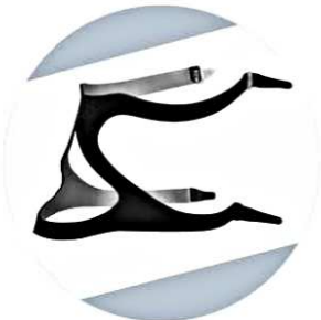
Breatheable Foam Headgear