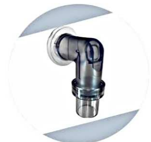
Nonvented Elbow Connector for noninvasive ventilator usage