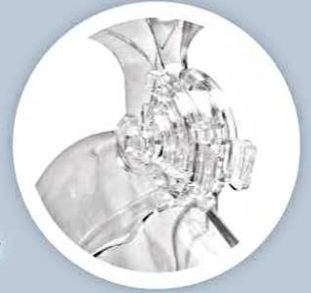
Adjustable polycarbonate head support