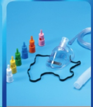
Oxygen & Aerosol Therapy