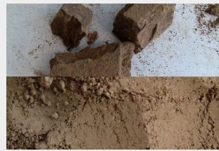
cocoa filter cake