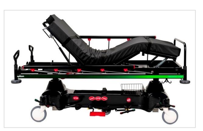
4 Sections Mattress Platform (Optional)