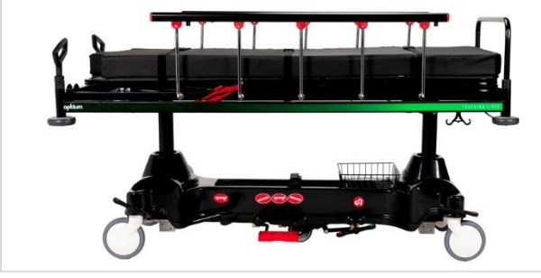
Column construction facilitates the handling with C-arm