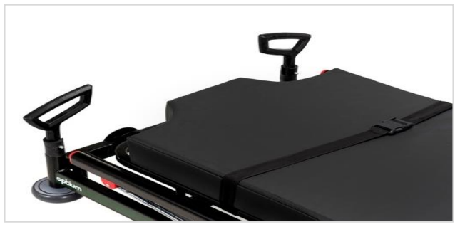
Pushing handles are foldable