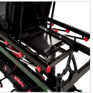
X-ray cassette holder sliding under whole mattress