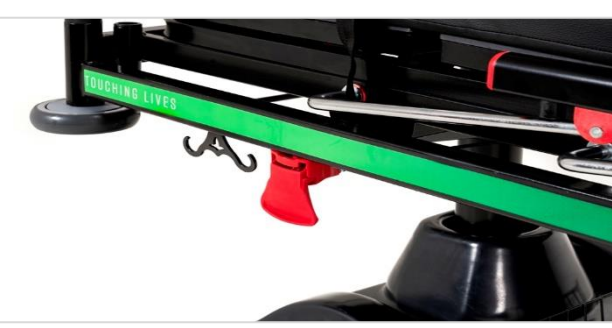
Lengthwise gauges on the stretcher frame enable easy positioning of the cassette