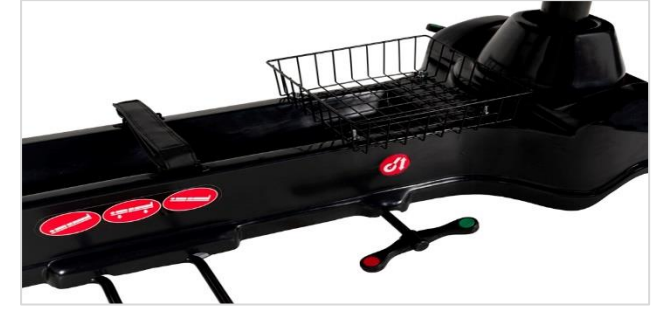
Oxygen tank holder integrated on sub-frame, 12Liter