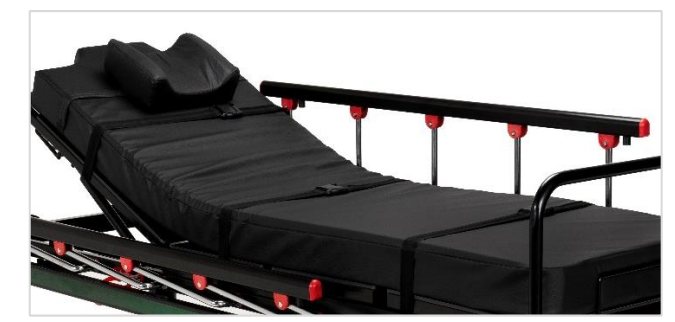
Safety belt (optional)