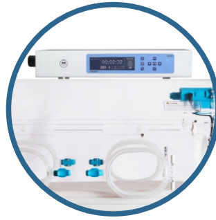
● Top of the incubators