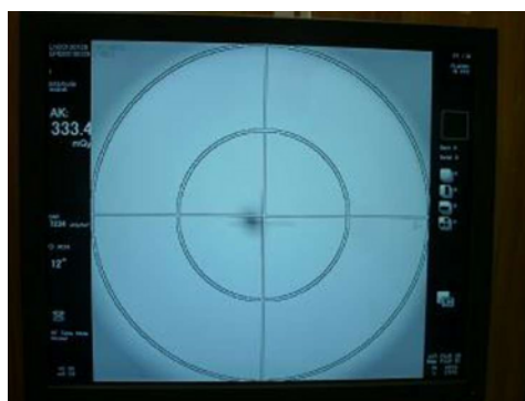
Fig. 2.6.3 X-ray Alignment (Monitor)

Refert to 15 [Appendix 3] Showing the cross cursor on the ACQ-PC monitor" in DR-300 Installation Manual for how to display the cross cursor on the display.