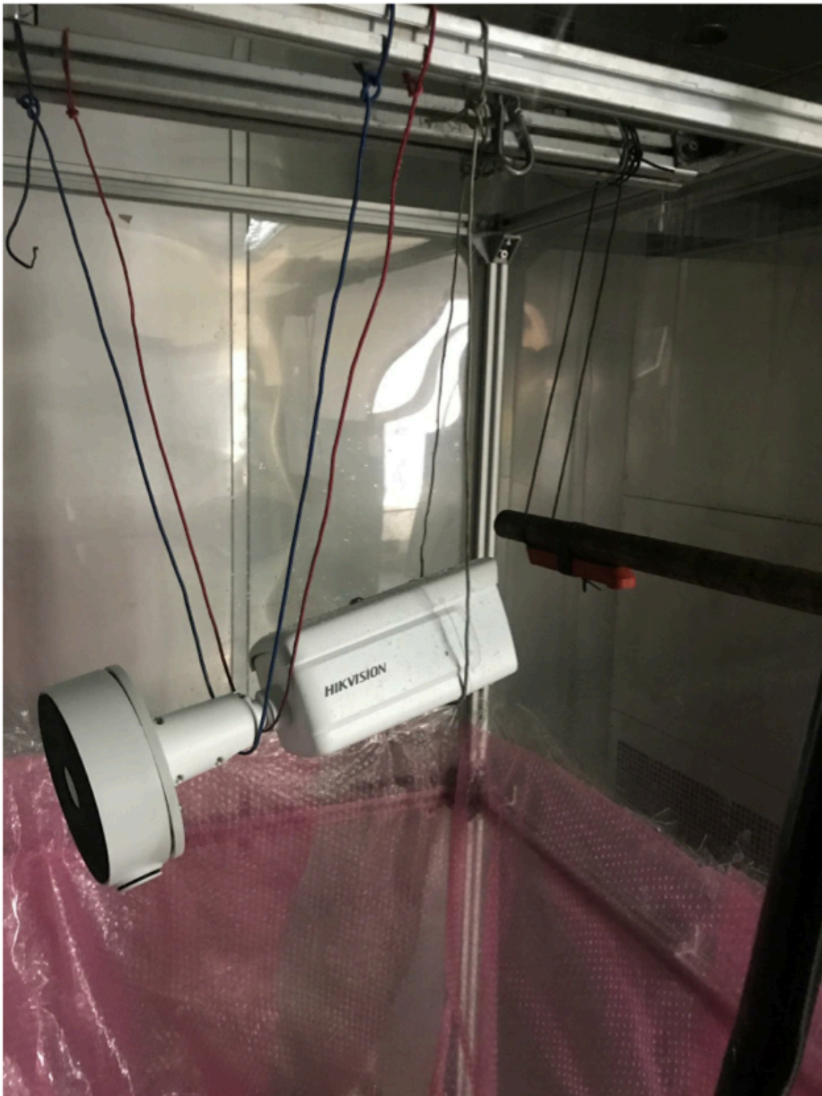
Fig.2 sample1# (during external icing test)