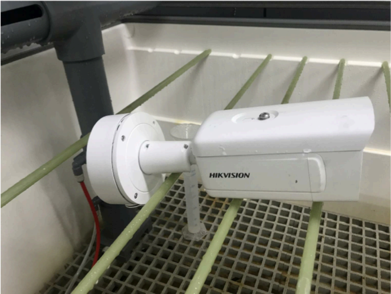
Fig.4 sample1# (during outdoor corrosion test)