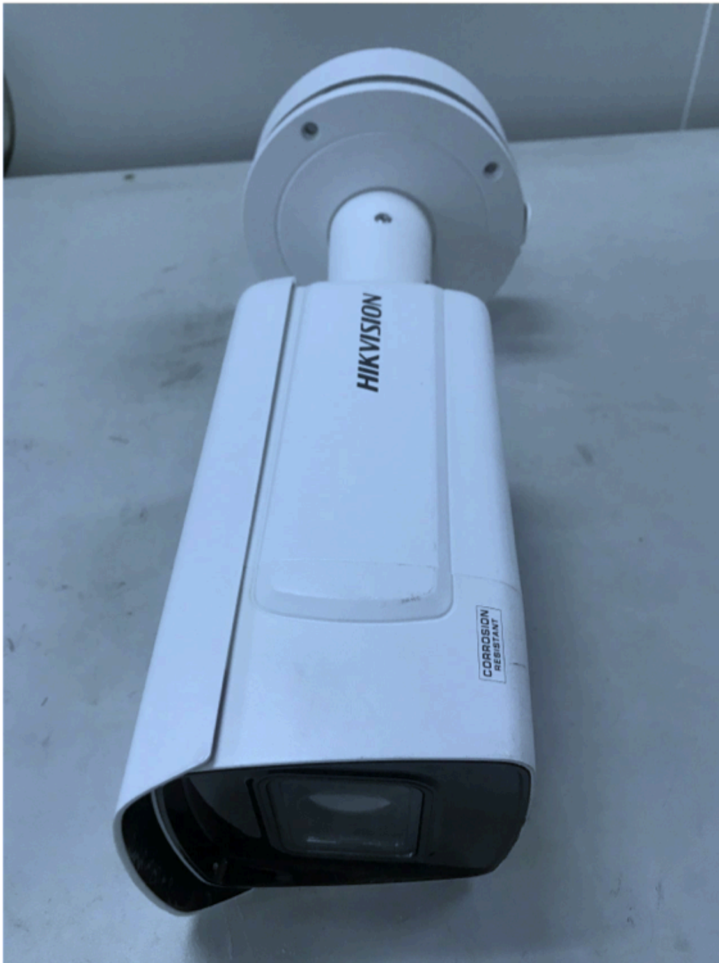
Fig.5 sample1# (After outdoor corrosion test)