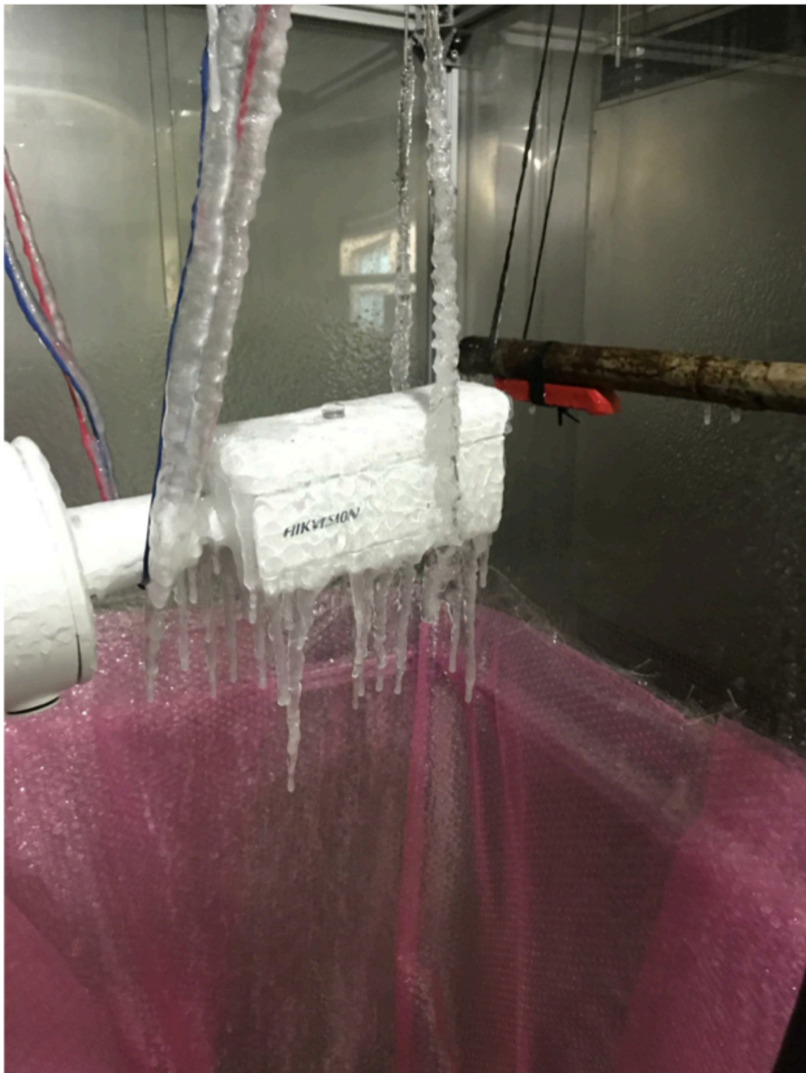
Fig.3 sample1# (after external icing test)