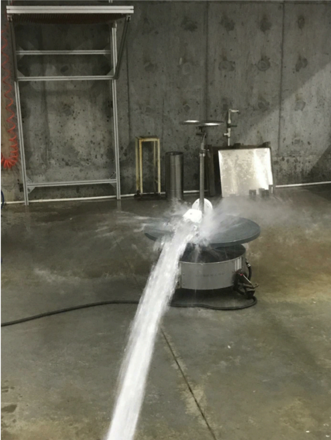
Fig.1 sample1# (during waterproof test)