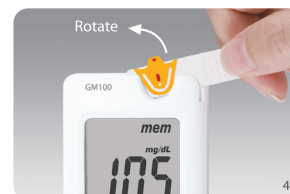
Safety-Keep from touching blood sample