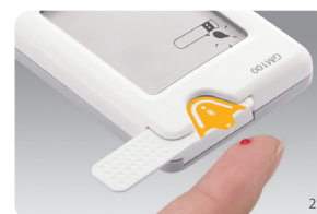
Less pain-1.4 μL blood sample only, automatically drawn in