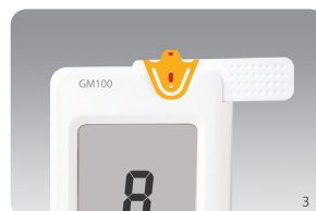
Rapidly-results less than 8 seconds