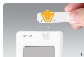
Friendly-large strip hand bar